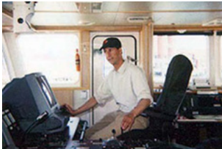
Owner and master on the first vessel.