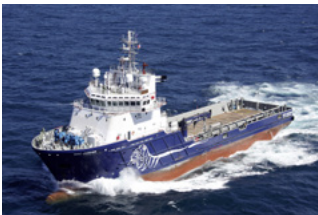
OOC today: State-of-the-art.