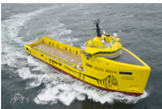
Two Damen 3200 Clean Design PSVs joined the OOC fleet 2018.