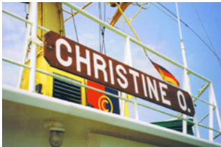
Profit centre CHRISTINE O.

“On the Friday the 13th of November 1998, 20 years ago, to the day, I laid the foundation for my shipping company Opielok Offshore Carriers.”